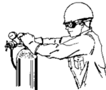
Figure 2: The Correct Way to Safety Check a System.

Because oxidizers change the chemistry of fire, a material that does not burn in air may ignite or react violently in an oxidizer atmosphere. Equipment used in oxidizer service should be selected with materials of construction that minimize the probability of ignition and the risk of fire or explosion. This equipment must be cleaned to remove any contaminants such as oils or grease. Care must also be taken to eliminate any residual cleaning agents. Regulators used in oxygen service should be maintained exclusively in oxidizer service. If a regulator is used in other types of service, it may no longer meet oxidizer clean requirements.